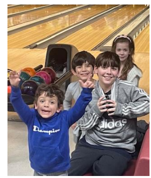
Attack of the Keating Grandkids!