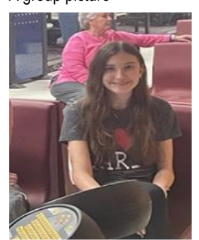
A smile between frames